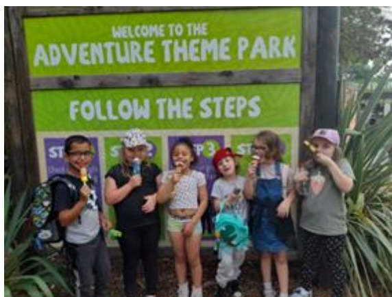
West Midlands Safari Park August 2022