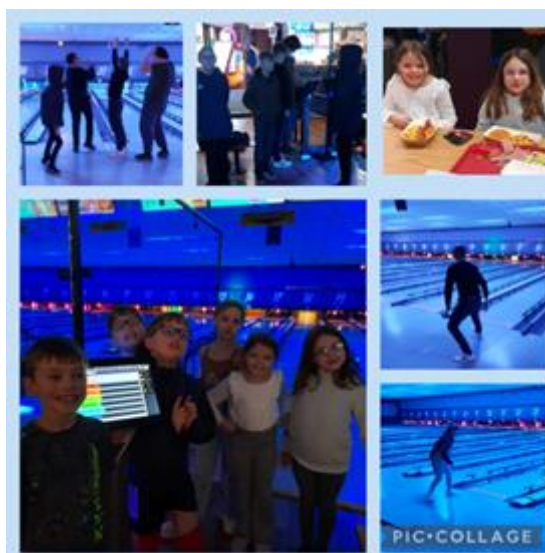
Bowling Warwick January 2023