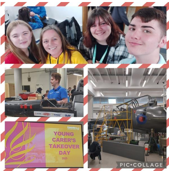
Young Carers Take Over Day March 2023