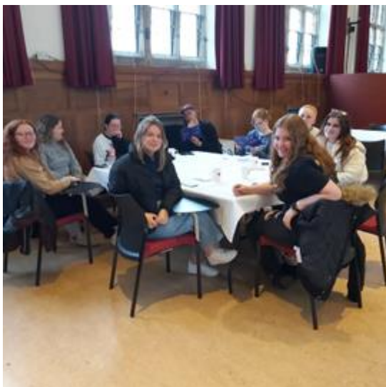
Bangor University April 22

Running trips and activities across the county has continued to be challenging, with transport costs, capacity and logistics often limiting what we can do. However, with the support of local donors, Rotaries and grant funders we have been able to roll out a regular offer of trips and activities for young carers across the county.