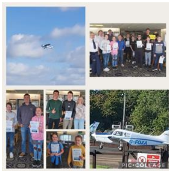
Smiling Wings Rugby & North October 2022