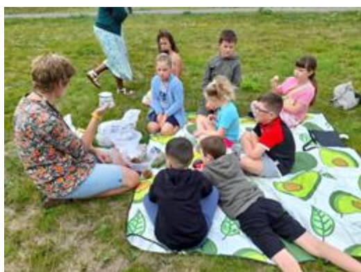
Garden Organic Rugby August 2022