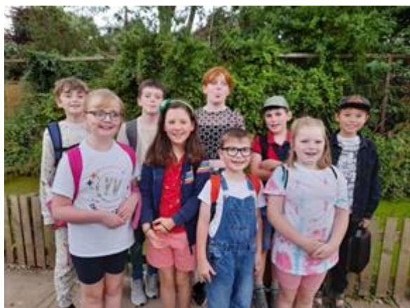
Butterly Farm Stratford August 2022