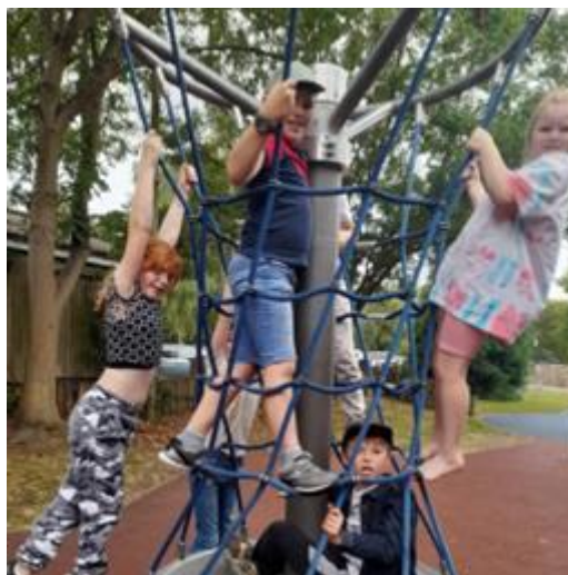
Picnic in the park Stratford July 2022