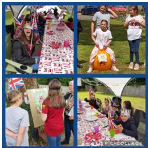
Queens Jubilee Party North May 2022