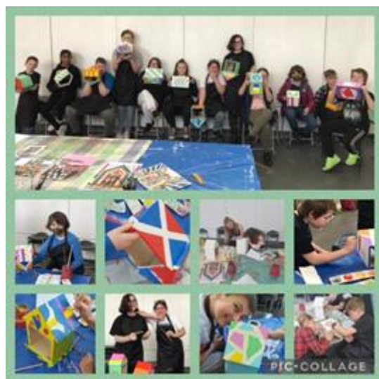
Compton Verney April 22