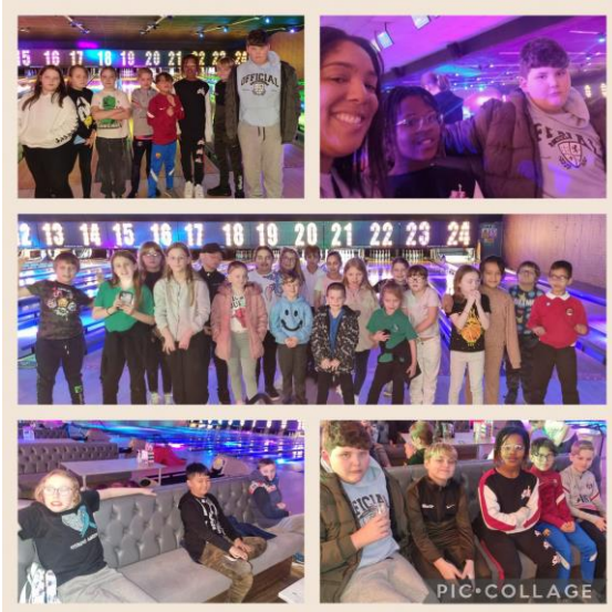
Bowling Nuneaton & Bedworth February 2023