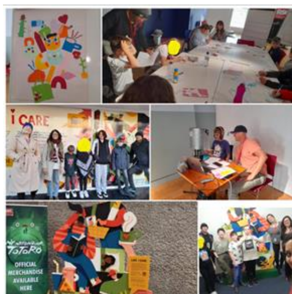
The Royal Shakespeare Company December 2023