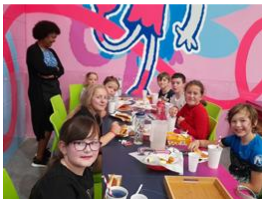
Jump In Warwick July 2022