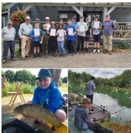
Lavendar Hall Fisheries North July 2022