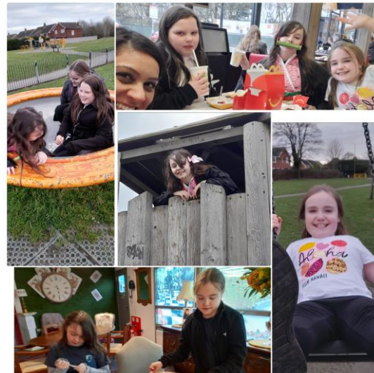
Befriending March 2023