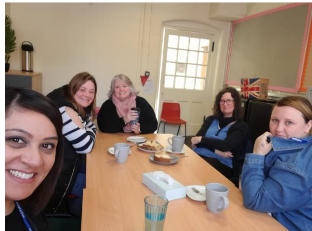
WYC Helping Hands Coffee Morning March 2023

It has been six months since the transition of the statutory contract and Warwickshire Young Carers moving forward into a new and exciting period. Looking ahead, we are continuing to develop new relationships across the county with other organisations to support young carers and families, we are developing and growing our Befriending and Family Support offers with Transitions and Young Adult Carer support continuing to be a main priority of the charity.